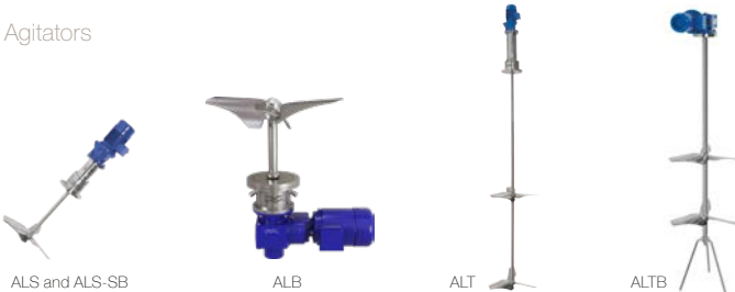
ALS and ALS-SB