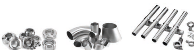
Flanges, clamps and unions