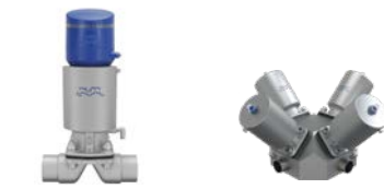
Unique DV-ST UltraPure