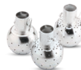
LKRK Static Spray Ball