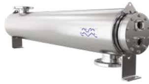
Pharma-line S and P