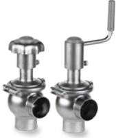
Unique SSV Manual