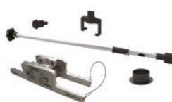
Service tools mixing and blending