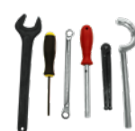
Service tools tank cleaning