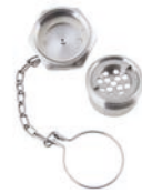
SB Micro Sample Port Type M