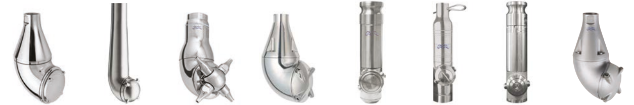
SaniJet 25 UltraPure