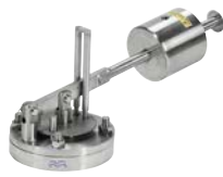
SB Pressure Relief Valve