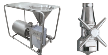
Hybrid Powder Mixer