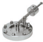
SB Anti Vacuum Valve