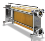
Plate and frame module