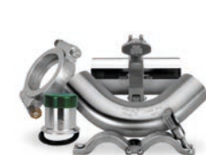
UltraPure tubes and fittings