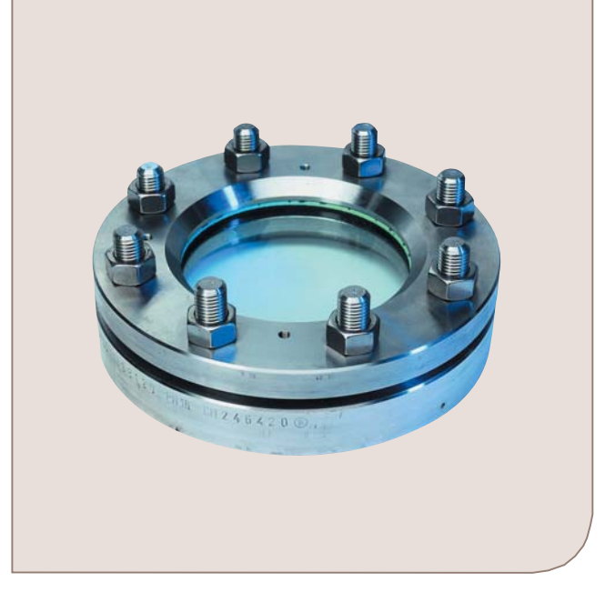
Fig. 1. Sight Glass DIN 28120.

Max. product pressure: Max. 1000 kPa (10 bar) -10°C to +140°C (EPDM), (higher temperatures up to 280°C with gaskets of Klingersil).